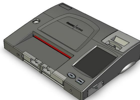
ICP Tabulation Machine

The Poll Supervisor will then ensure the complete results tape is returned with the tabulation machine to the returning office. The Tabulation Machine Officer will retain the last (second) portion of the results tape in case the machine is damaged en route to the returning office.